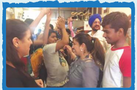
CafeCulture and CII IWN Delhi organized a fun packed event in GK for our Day Care teenagers.