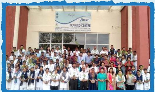
The knowledge and training department organized Annual Foundation Course in Palliative Care with the support of Cipla Foundation at Syadwad Institute of Higher Education and Research College of Nursing, Baghpat on 8-9 August, 2019. A total of 73 students and 25 faculty members attended the two-day course.