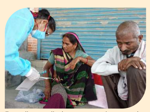
Extending medical support to migrant workers