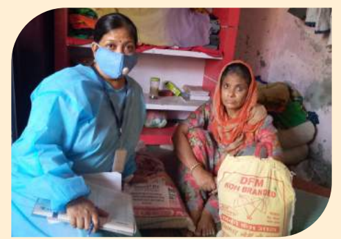
Distributing dry food ration to destitute families