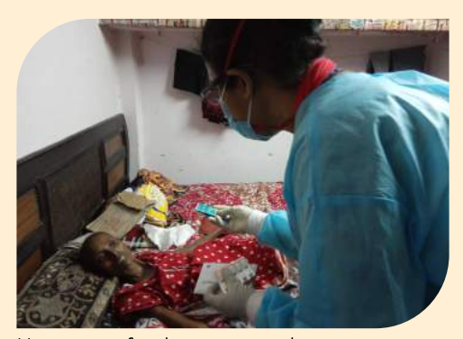
Home care for the most needy